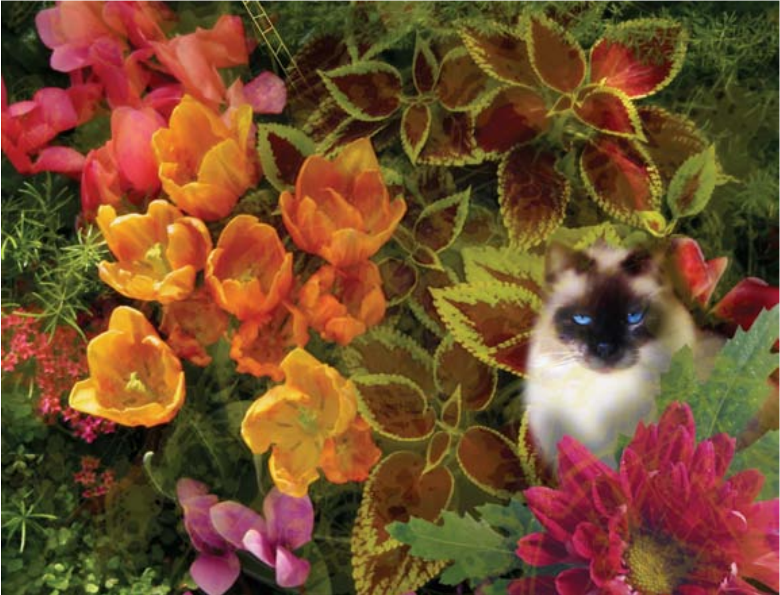
THROUGH THE TULIP FIELD ▶ image size 26" x 34"