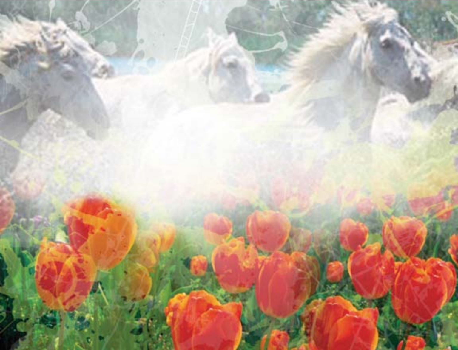
GUARDIAN OF THE FLOWER BED ▶ image size 26" x 34"