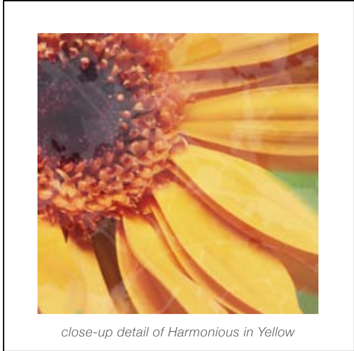
close-up detail of Harmonious in Yellow