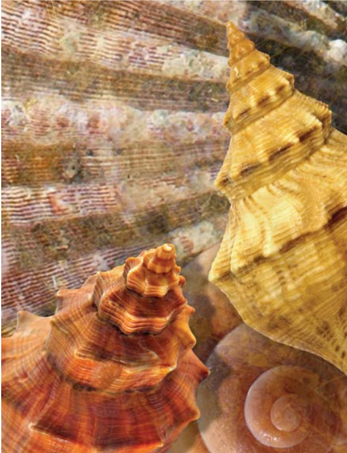
HARMONY IN COLOR ▶ image size 34" x 26"