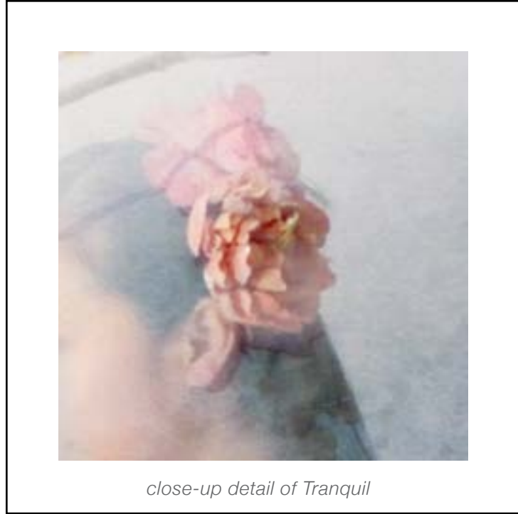
close-up detail of Tranquil