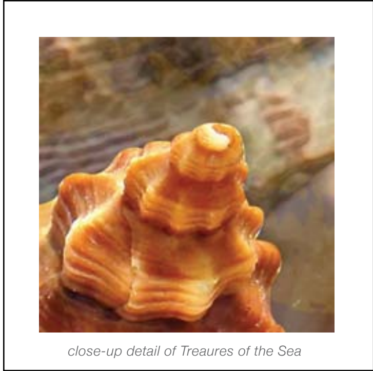
close-up detail of Treasures of the Sea