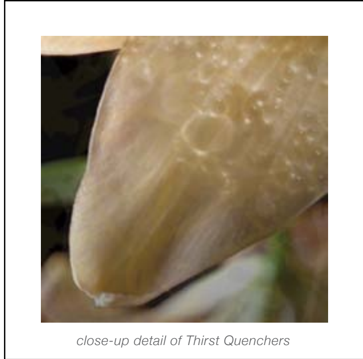
close-up detail of Thirst Quenchers