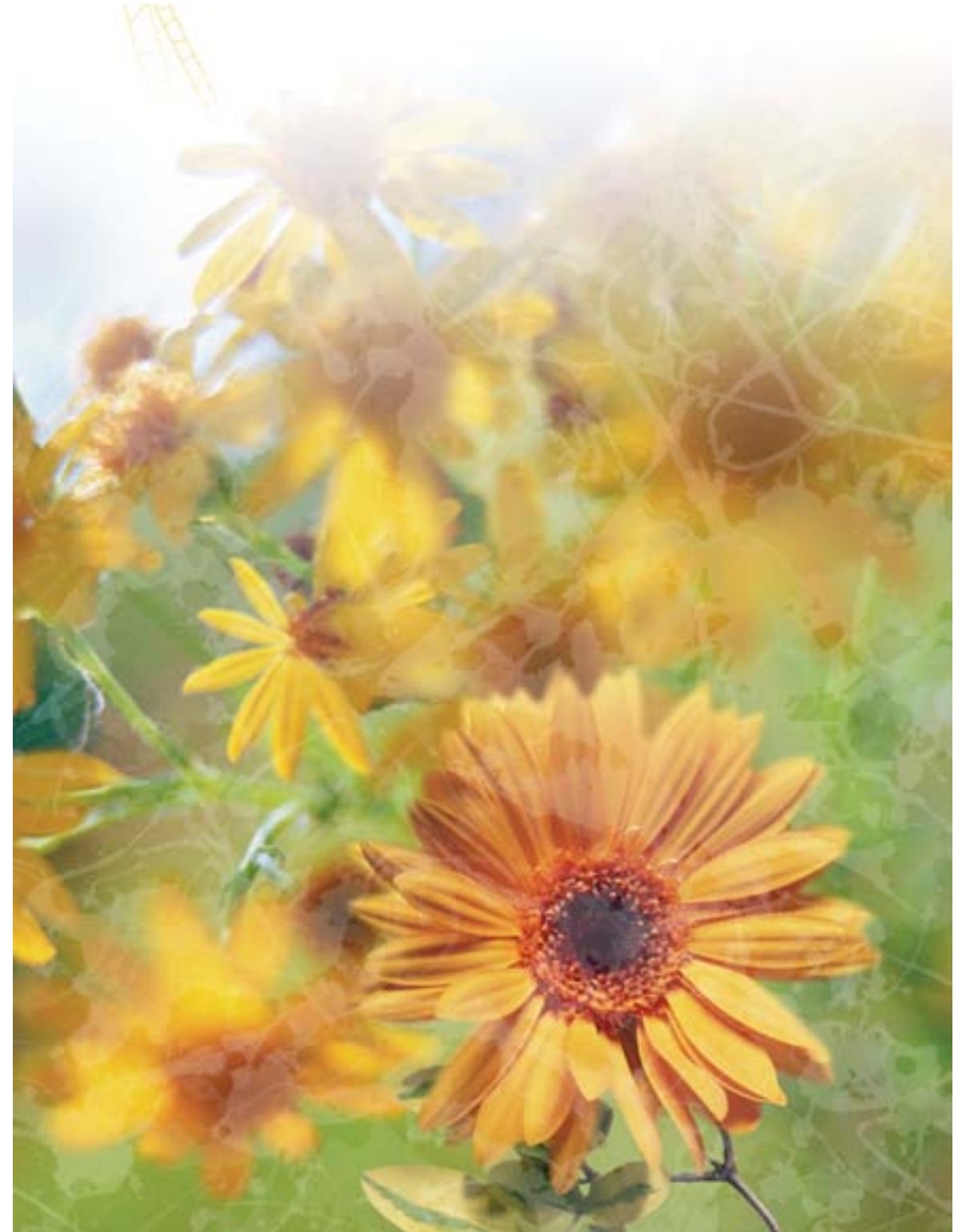
TRANQUIL ▶ image size 26" x 34"