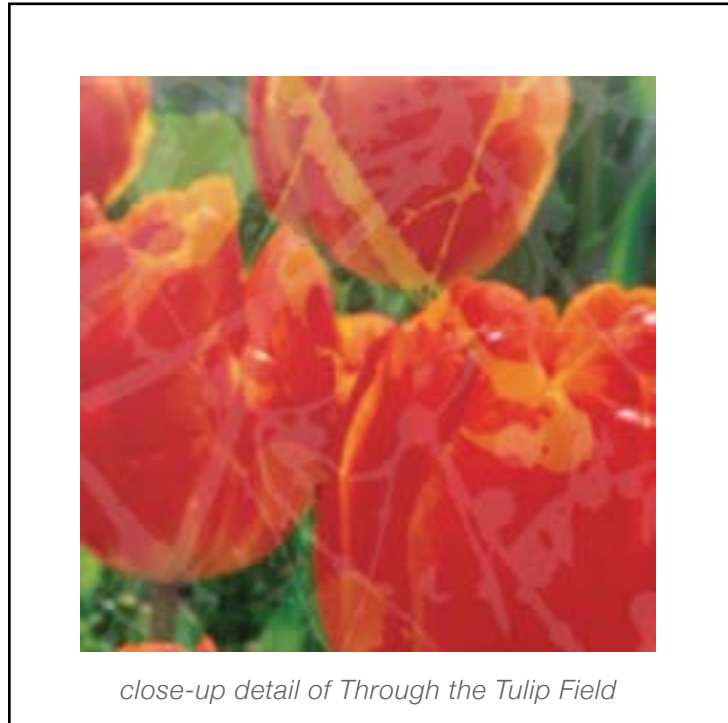
close-up detail of Through the Tulip Field