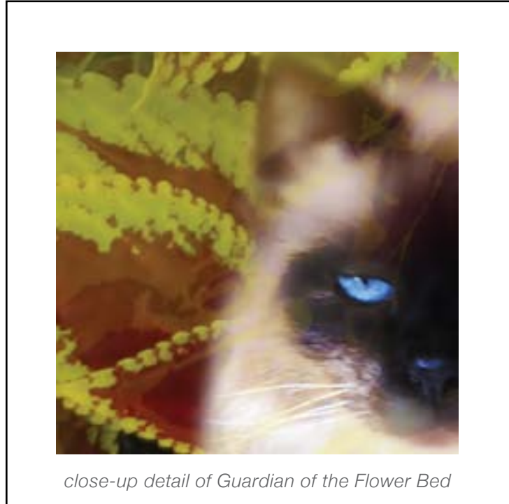
close-up detail of Guardian of the Flower Bed