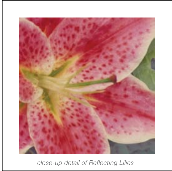
close-up detail of Reflecting Lilies