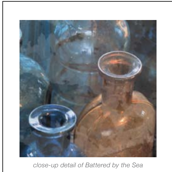
close-up detail of Battered by the Sea