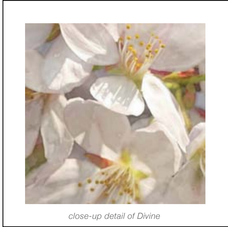
close-up detail of Divine