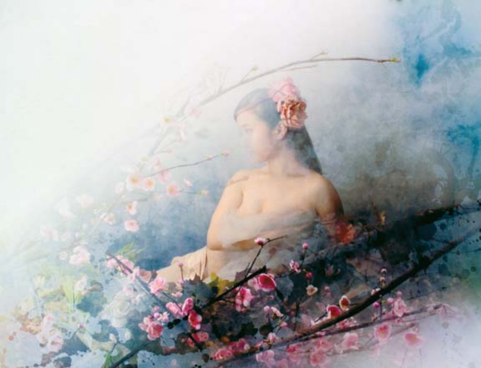
HARMONIOUS IN YELLOW ▶ image size 34" x 26"