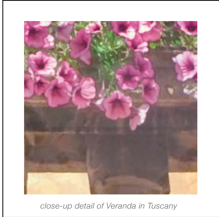
close-up detail of Veranda in Tuscany