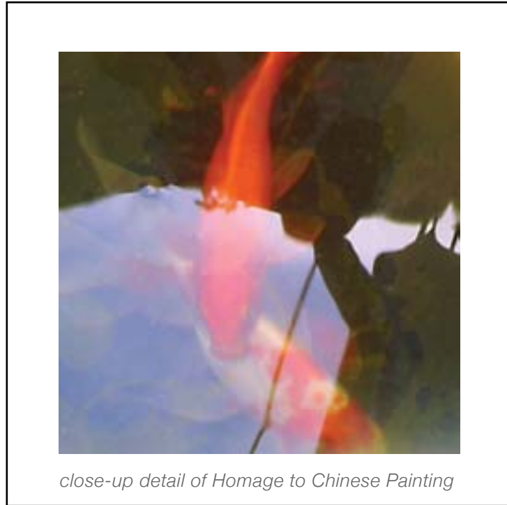
HOMAGE TO CHINESE PAINTING ▶ image size 34" x 26"