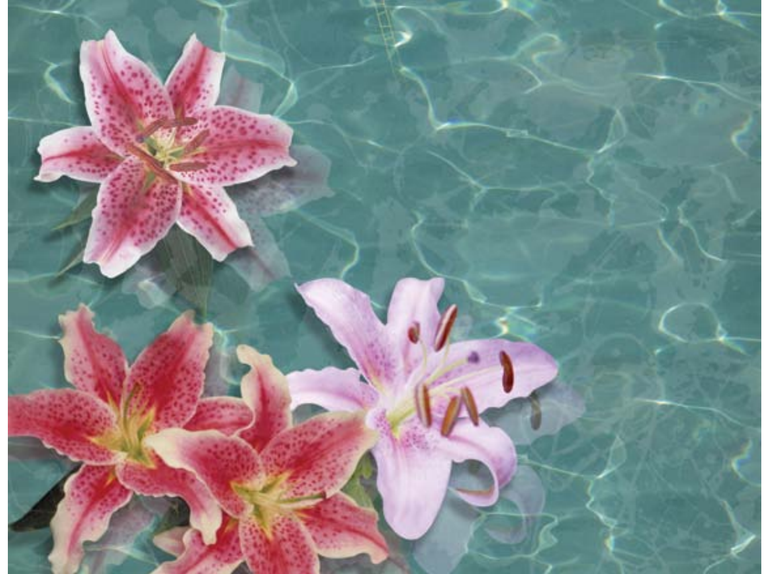
VERANDA IN TUSCANY ▶ image size 26" x 34"