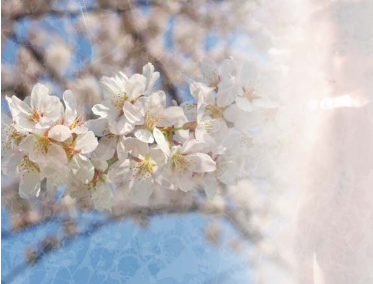
THIRST QUENCHERS ▶ image size 26" x 34"